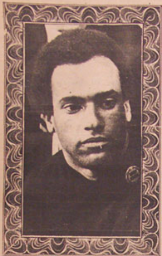
HUEY P. NEWTON