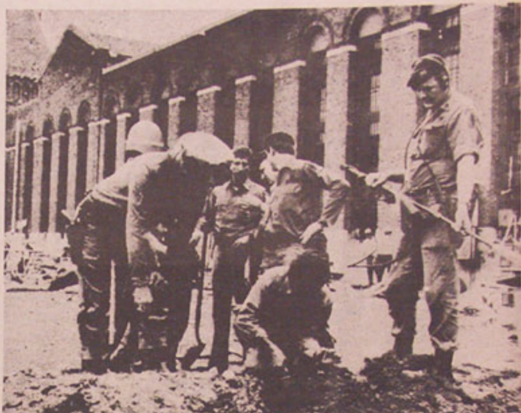
"Why weren't the journalists shown the bodies of the whites who had their 'throats cut'...?"

For this we should go back to San Quentin, to the assassination of George Jackson and to the death of the three guards - two of whom supposedly had had their throats cut - and two white stool-pigeons, whose throats were also cut. We must question this version of the assistant director of police at San Quentin. In fact, the prison was closed for five days, the prisoners' families and the lawyers were forbidden entry. Why weren't the journalists shown the bodies of the whites who had their "throats