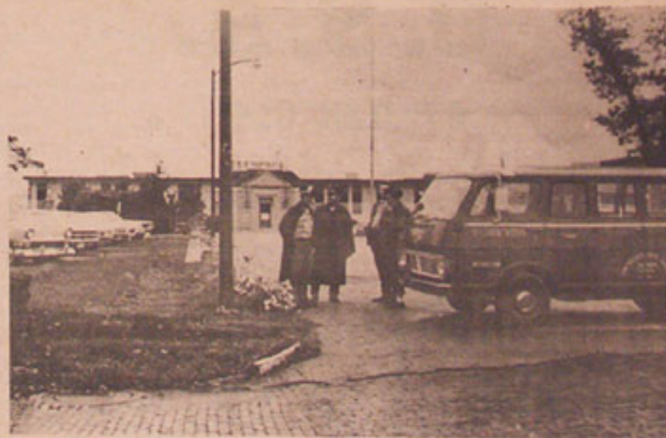
Prison entrance was blocked with vans surrounded by guards.

so that the prisoners' friends and relatives can maintain communications and unity with them, we began to receive numerous and intimidating phone calls from the Police and FBI, saying we could not go on our scheduled visit this week and if we attempted to