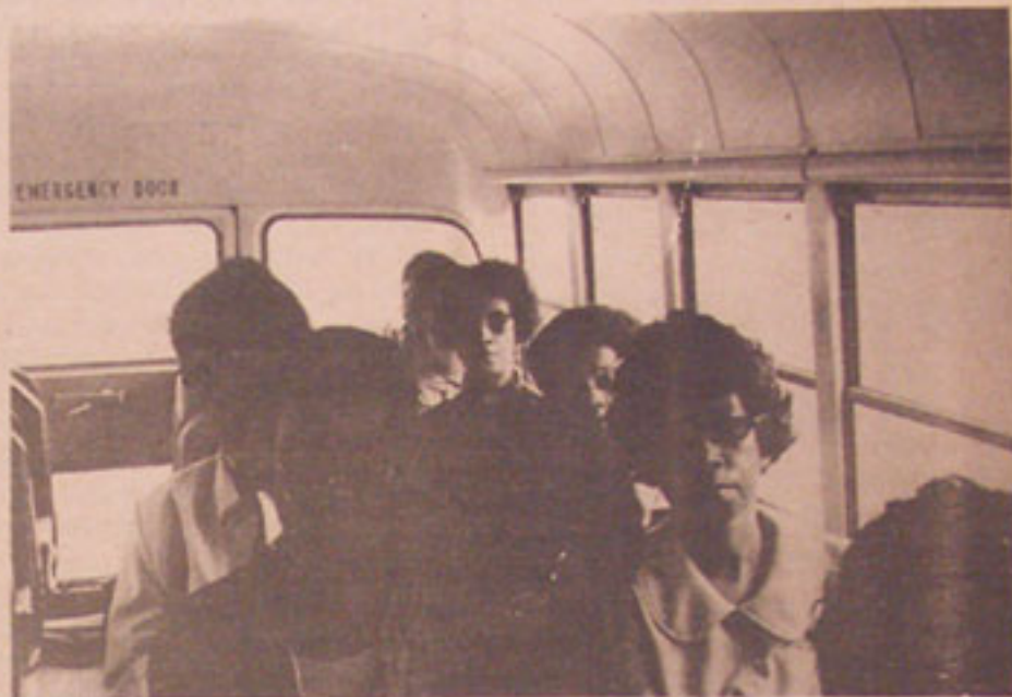
Relatives and friends travel 120 miles only to be denied visit.

We then ended up having to get another bus company (also a Black bus company) by the name of N.H.L. Transportation, Inc. who was able to provide us with only one bus. Upon arriving at the prison entrance, we found it blocked by a van surrounded by prison guards. When approached by the friends and relatives of the prisoners, the guards tried to project a non-hostile attitude and give a detailed explanation of what had happened while still denying our entrance. The stories were well rehearsed and were a repeat of what appeared in the papers. Our lawyer who began to demand entrance to talk to the warden was finally allowed to enter after lengthy vacillation. The warden would only repeat what the papers had quoted him as saying with exception that all visiting privileges had been suspended and investigations were being conducted to find the leaders of the 300