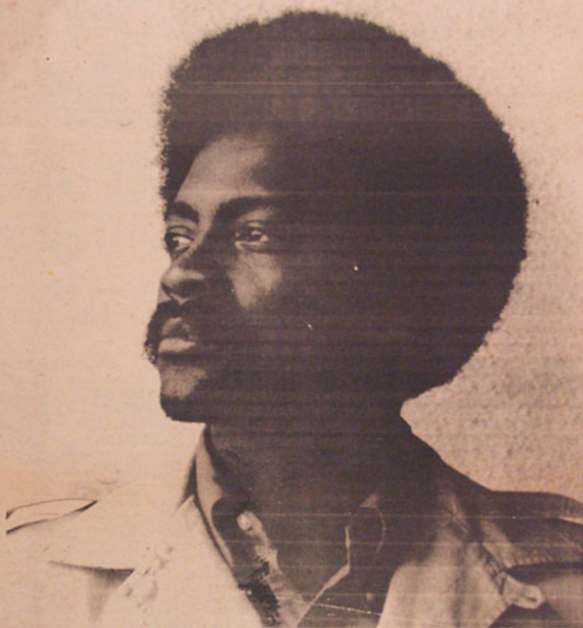
ALPRENTICE "BUNCHY" CARTER Dep. Minister of Defense, Black Panther Party, Southern California Chapter Born: October 12, 1942 Assassinated: January 17, 1969