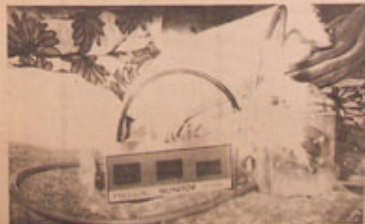
Technicians never came to connect vital parts to kidney machine.