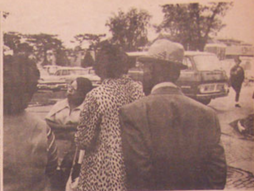
Families and friends of prisoners listen to the lies of Pontiac prison guards.